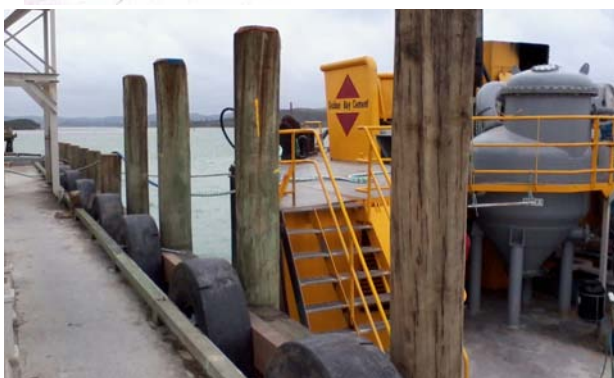
Top left—One of the many straddle carrier tyres used to buffer the fender piles and wharf.